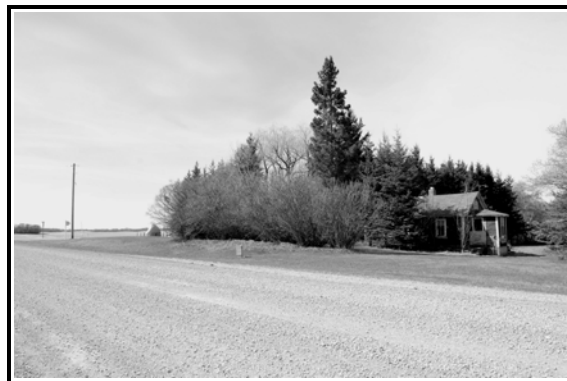
Old Burla Residence, abandoned. (left: close-up, right: showing placement) Photo: 2010